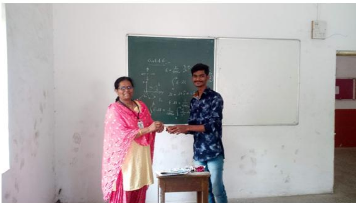
Felicitation of active students by gift distribution.