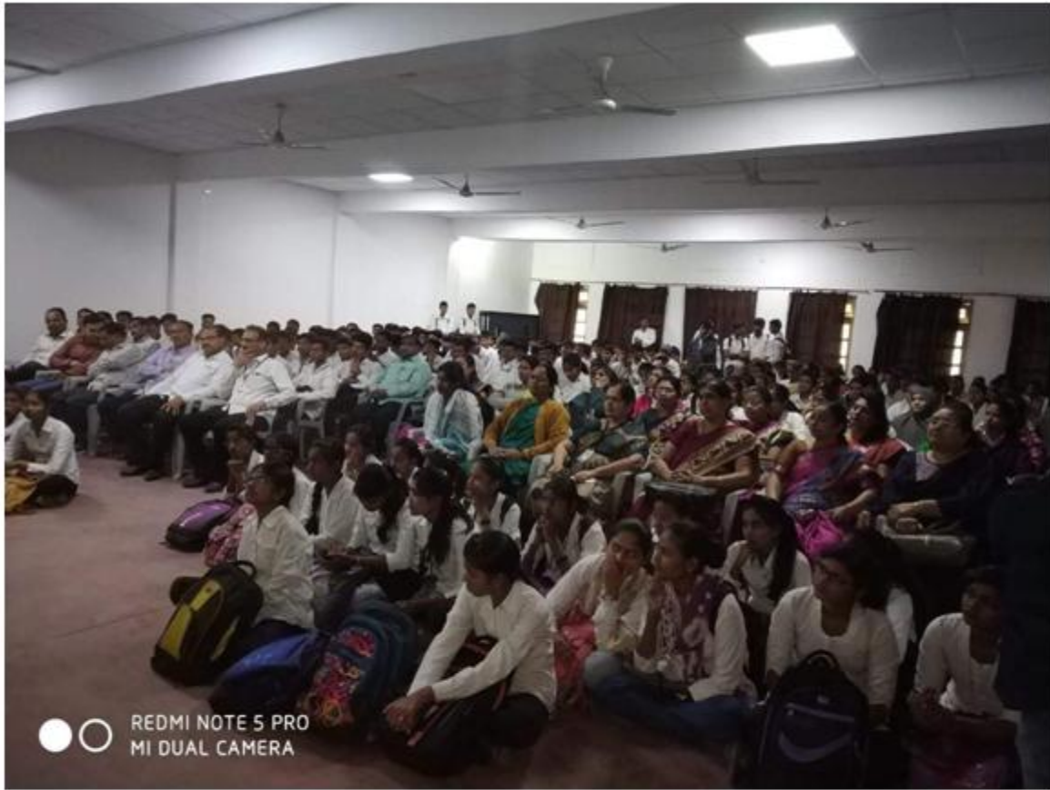
ICC programme !3 Jan 2019