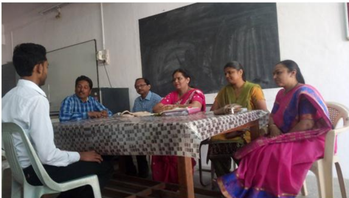
Personal interview of students: Annual social gathering January 2019