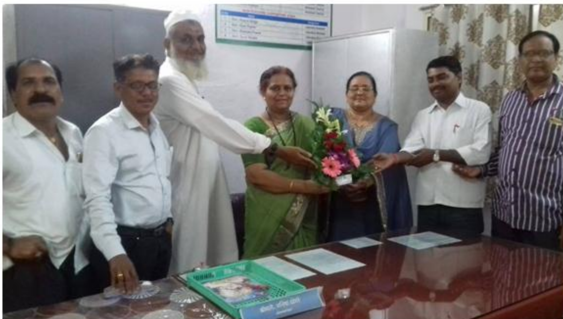
Felicitation as a Head of the dept. by Staff members 1-10-2019